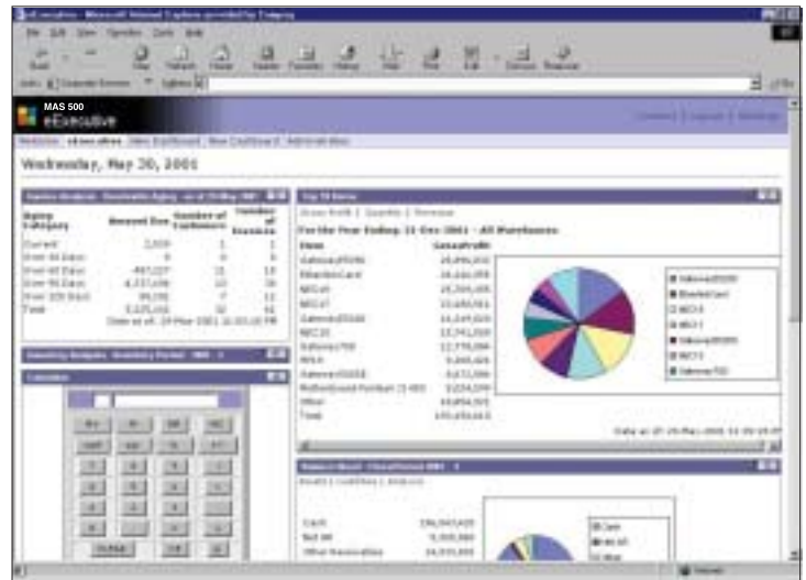
eExecutive integrates information from the Internet, desktop application, and MAS 500.

Executives can quickly spot and respond to trends and abnormalities by monitoring select information from their MAS 500 database including summaries and detailed views of sales (by product line, location, customer type), product and customer analyses, income and balance sheets, as well as inventory reporting by date